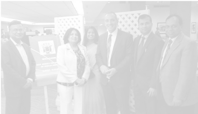
Members of the New Jersey chapter of the American Association of Physicians of Indian Origin (AAPI) at its annual health summit and meeting at the Double Tree Hilton in Newark, New Jersey, Nov. 22.